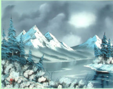
Cold Winters Morn

Forthcoming workshops include the following paintings so pick your favourite & 'lets have some fun.'